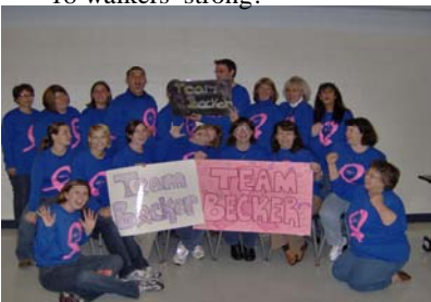
Team Becker get’s down— 18 walkers strong!