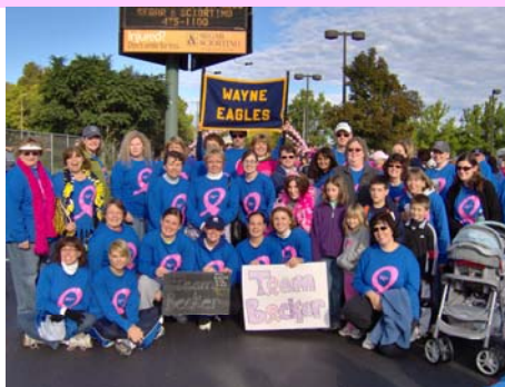
On the move—to cure Breast Cancer!