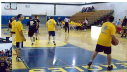
Those overgrown MS and HS "Kids" are at it again!