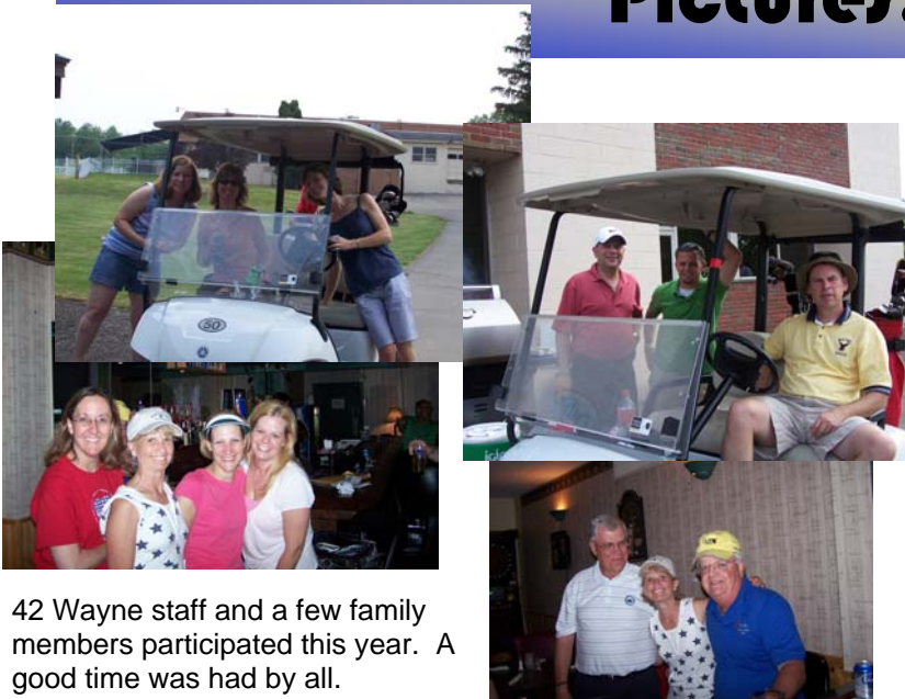
42 Wayne staff and a few family members participated this year. A good time was had by all.