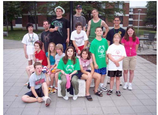
June 12-15, 2008, 12 athletes and 6 coaches from WCSD Special Olympic Team attended the Special Olympics State Games at Binghamton University.